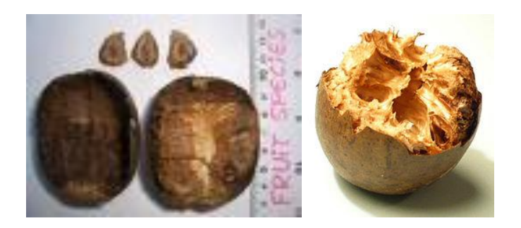
Fig. 3: The dried fruit of Siraitia grosvenorii [2].

This is one of four species of Siraitia . Botanic synonyms include Momordica grosvenorii and Thladiantha grosveno rii . The flower and fruit develop in early spring. The plant can effectively produce fruit for 8 years. Ripe Lu Han fruit is collected in late autumn. The fruit (Fig. 3) is one of several kinds that were believed to be plants of longevity. They feature fleshy, sweet fruit pulp and numerous seeds [4].