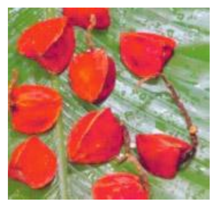
Fig. 6: The fruit of Thaumatococcus danielli [2].

Thaumatococcus daniellii Benth fruit (Fig. 6) is a source of thaumatin, a substance of protein character. The Thaumatococcus daniellii plant grows in the humid and hot areas of West Africa's tropical forests. It is easy to find in the southern parts of Ghana, Ivory Coast and Nigeria. It is also known in Angola, the Central African Republic, Uganda and Indonesia. Also known as "katamfe", it is a single-leaf perennial plant.