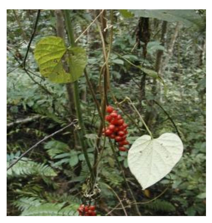
Fig. 8: The plant and the fruit of Dioscoreophylllum cumminsii (West Africa) [2].

The fruit is harvested from September to October. Currently, 3-6 kg of pure protein can be acquired from 1 kg of fruit. The fruit of Dioscoreophyllum cumminsii is eagerly consumed by the people of Congo. The first description of