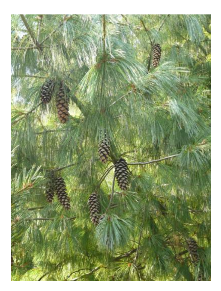
Fig. 12: The Scots Pine (Cynara scolymus) [2].