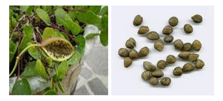
Fig. 9: The plant and fruit of Capparis masaikai Levl (Capparaceae) [2].

In the Chinese Yunnan province, one can encounter a plant called Capparis masaikai , which is a source of a sweet substance called mabinlin. Capparis masaikai grows in the subtropical region of the Chinese Yunnan province (Fig. 9). The residents of this area often chewed the seeds of this plant to taste its sweetness. Informally, C. masaikai is called "mabinlang" [13].