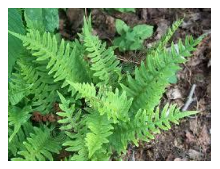
Fig. 4: The common polypody (Polypodium vulgare) [2].

The sweet taste of the common polypody results from the bis-glycoside present in the concentration of about 0.03%. Bis-glycoside is considered a new type of steroid saponin called osladin. It tastes similar to stevioside or glycyrrhizin. Osladin is about 3000 times sweeter than saccharose, but due to its very low concentration in the rhizome of the plant, its use as a sweetener is very limited.