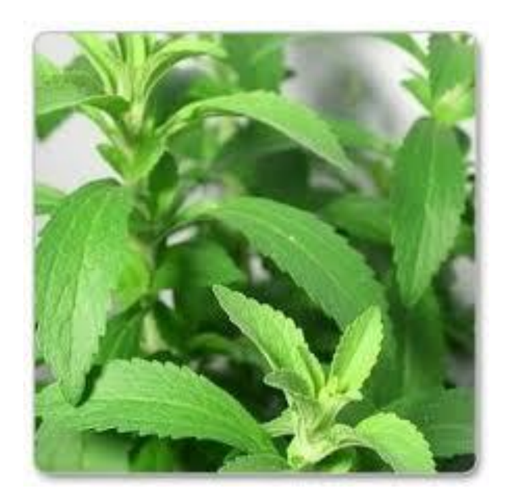
Fig. 1: The leaves of Stevia rebaudiana [2].

In South America, the plant is known under the names: Caa-che, Azuca-caa and Cua-eh, meaning "a sweet plant". The sweet substances are found in the leaves which feature